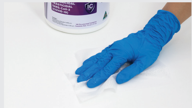
B: Wiping the decontaminated area from top to bottom in an S-shaped pattern, ensuring not to go over the same area twice.