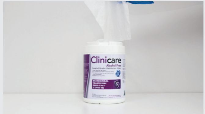
A. Dispense another Clinicare towelette