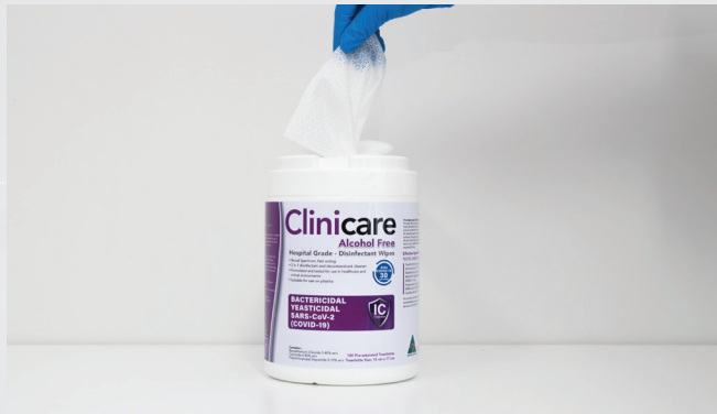
A. Dispense Clinicare towelette