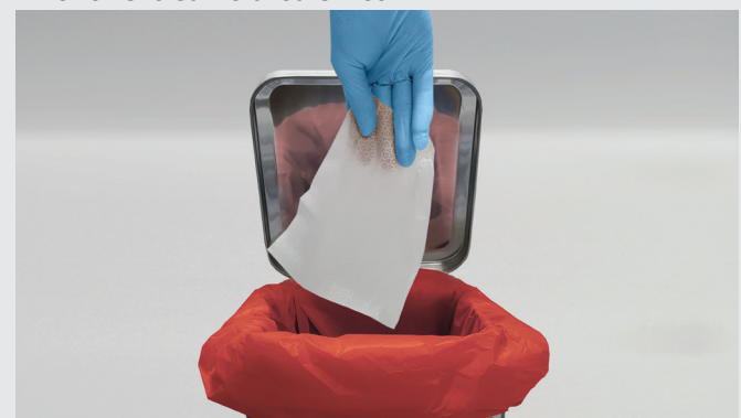
C. Dispose of used towelette