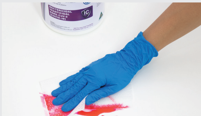
B: Wiping from clean to dirty in an S-shaped pattern, ensuring not to go over the same area twice